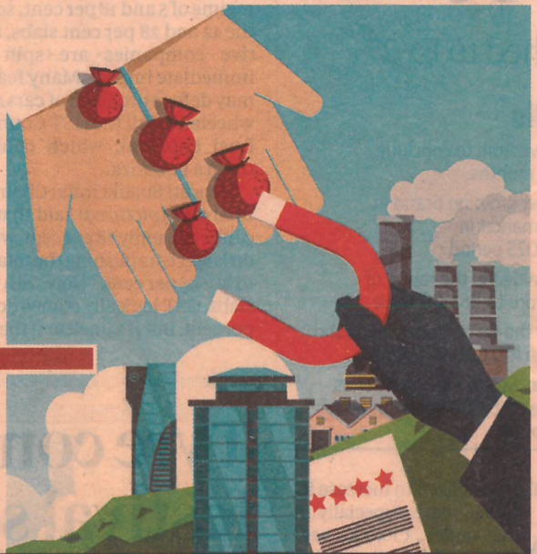
ILLUSTRATION: BINAY SINHA

In FY24 and FY25, Indian corporates actively tapped global markets to raise funds as international liquidity remained supportive and domestic demand alone could not meet funding needs. In the previous financial year, overseas borrowings stood at ₹60,445 crore due to steady demand for offshore capital despite global headwinds.