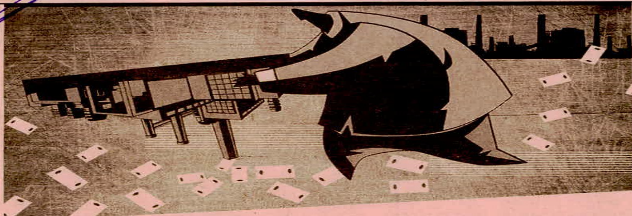
ILLUSTRATION: BINAY SINHA